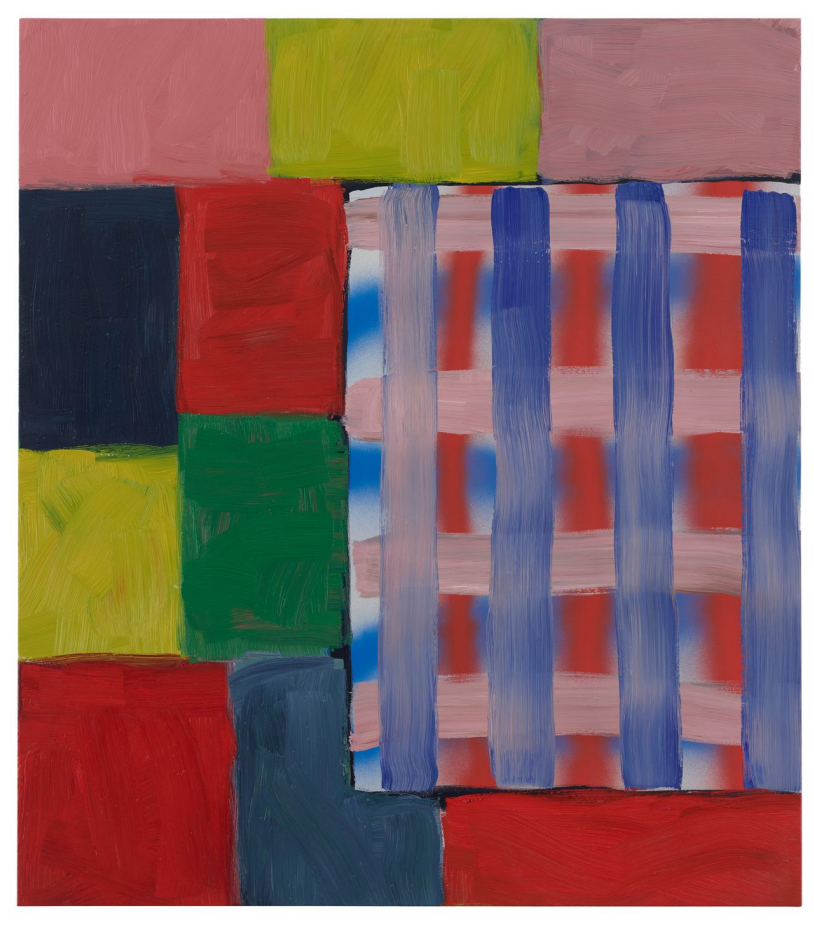
Sean Scully, 'Untitled (Window)' (2017). PHOTO: ELISABETH BERNSTEIN; SEAN SCULLY

The pandemic wreaked havoc on museums' exhibition schedules in 2020, and the 2021 calendar remains somewhat unpredictable. But a number of expansive, well-considered shows are planned for this year, including solo exhibitions spotlighting innovative contemporary artists. Several of those artists shared thoughts on the past year and what they're looking forward to in 2021. (Dates may change, so it's best to check with museums before visiting.)